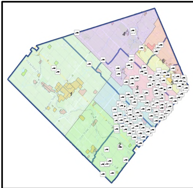
Figure 1: Location of properties investigated

Over 137 enforcement actions have been commenced because of these investigations. Depending on the severity of the By-law contraventions different enforcement actions were employed to seek compliance with the Town's By-laws. These enforcement actions