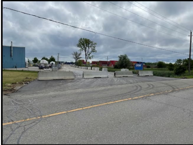
Figure 2: Example of physical enforcement action

Along with physical actions being taken such as the placement of barriers or removal of illegally placed fill, another action undertaken to help reduce the cost advantage of operating illegally has been to inform the Municipal Property Assessment Corporation (MPAC) through Finance staff of changes in use of the property and have the property reassessed. Often, illegal operators are surreptitiously converting farm properties to commercial properties and by informing MPAC of the actual use of the property appropriate taxes can be levied, ensuring equal treatment for legal and illegal operators. To date there have been 25 properties reassessed and this has resulted in more than a $384,000 increase in the tax levy for these properties; another 24 properties are still waiting to be reassessed. Staff also regularly inform our contacts at the Canadian Revenue Agency (CRA) of these operations as we have found that there is a significant amount of cash transactions between the vehicle operators storing their vehicles on the property and the operators of these yards. Staff also regularly communicate with other enforcement agencies such as the Toronto and Region and Conservation Authority (TRCA), Ontario Ministry of Transportation (MTO), Ministry of Environment, Conservation and Parks (MECP), and the Electrical Safety Authority (ESA) on these illegal operations and coordinate our enforcement efforts with them as much as possible.