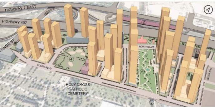
Table 2 compares the revised High-Tech TOC proposal with statistics derived from the draft Richmond Hill Centre Secondary Plan policy framework. Figure 4 shows renderings of development concepts for the draft Secondary Plan and High-Tech TOC proposal.