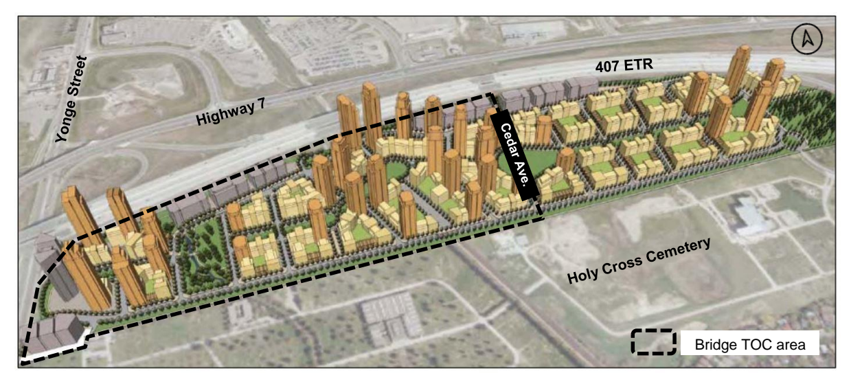
Figure 1 Langstaff Gateway Secondary Plan Development Concept and Bridge Transit-Oriented Communities Lands

The Bridge TOC development area comprises the western portion of the Langstaff Gateway Secondary Plan area, extending from Yonge Street to Cedar Avenue (Figure 1). The High-Tech TOC proposal is within the Richmond Hill Centre Secondary Plan area (Figure 2).