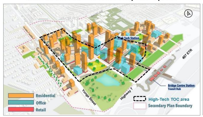
High-Tech TOC Proposal

Richmond Hill Centre Secondary Plan Update