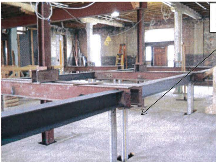
Main floor shoring to facilitate basement beam replacement