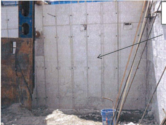
South Addition west wall basement concrete finish