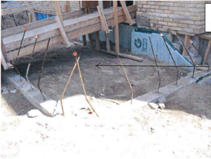
Backfilling complete at north elevation