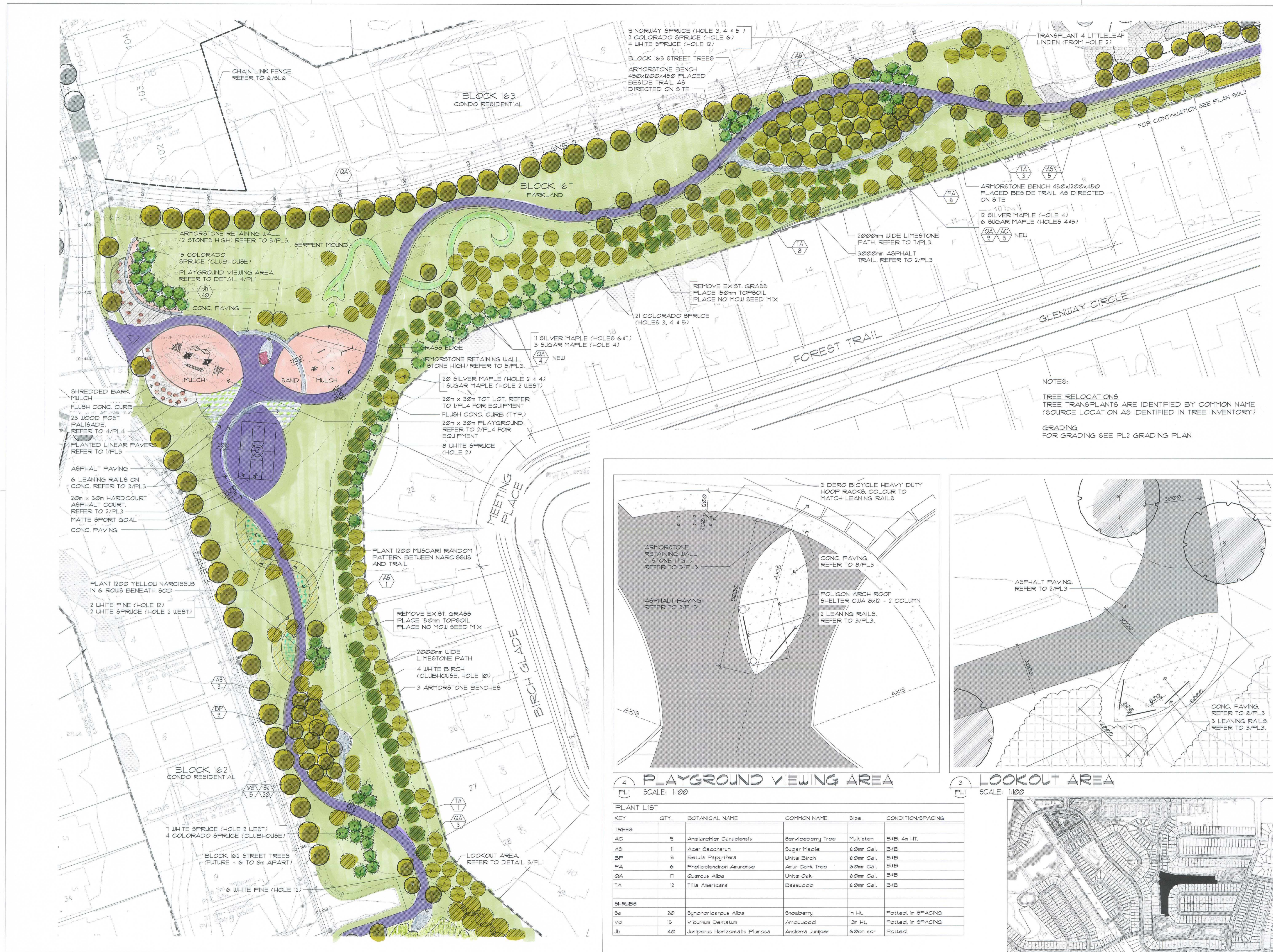
2 LANDSCAPE PLAN PL1 SCALE: 1:500