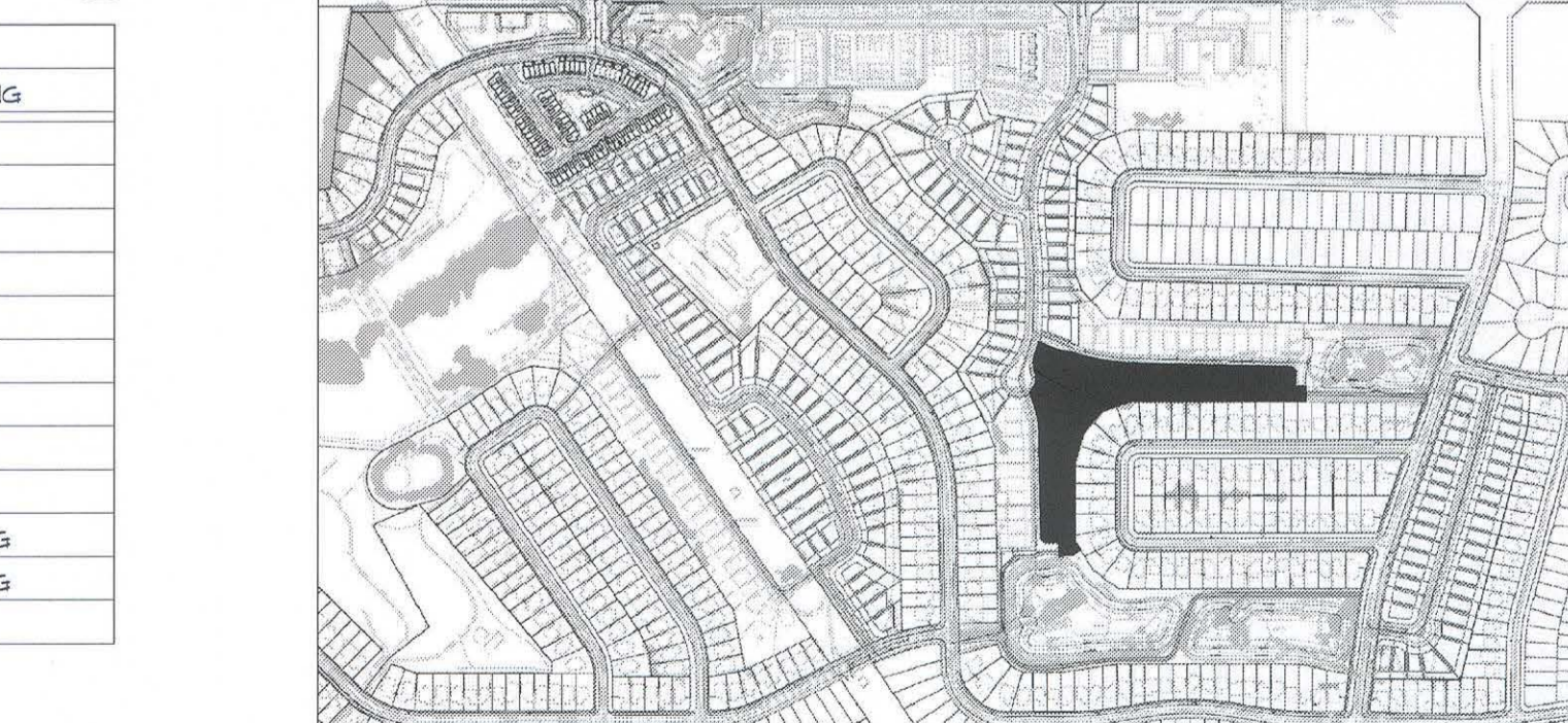
5 KEY PLAN PL1 SCALE: N.T.S.